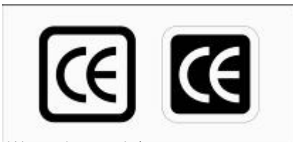
Wrong shape and size

Please note that the national European market surveillance authorities check for correct appliance of the CE-marking and can withdraw non-compliant products